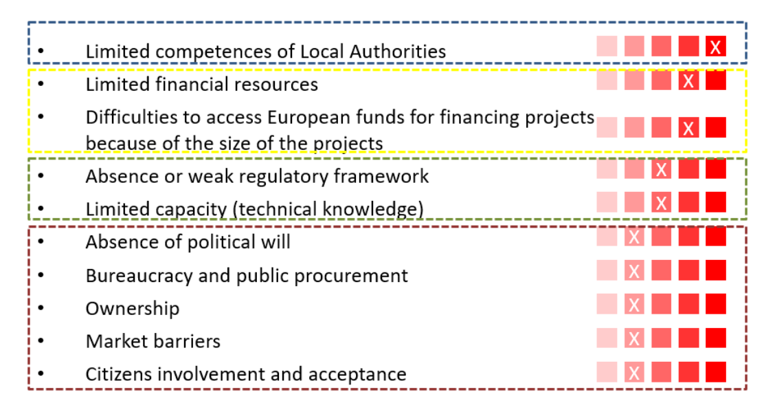
Figure 1: Main Barriers of Local Authorities to Implementing Sustainable Projects vs 2030 EU Targets

the required technical knowledge, bureaucracy and red tape that slow down decision-making, lack of political will, a weak regulatory framework and opposition from the local community, amongst others. Yet, local authorities are now asked to implement even more stringent targets, to meet the EU's 2030 Climate and Energy framework, where at least 40% cuts are required in greenhouse gas emissions (GHG) from 1990 levels, at least 27% share of energy has to be from renewable sources and at least 27% improvement is required in energy efficiency by the year 2030. The role and the involvement of local authorities for a sustainable future and for achieving these EU 2030 climate and energy targets is however indispensable.